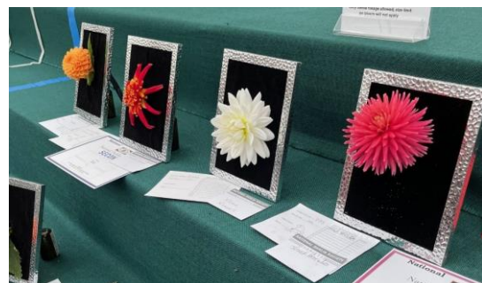
Picture Frame Challenge at NDS Show at Wisley 2022